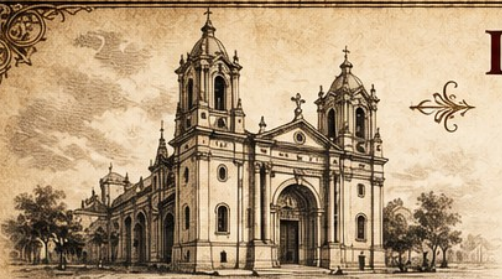
Catedral de Córdoba

"Go, therefore, and make disciples of all the nations." Matthew 28:19